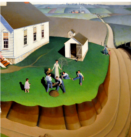
Grant Wood, 1932